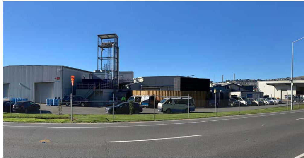
Port Hills Road - Front Gate