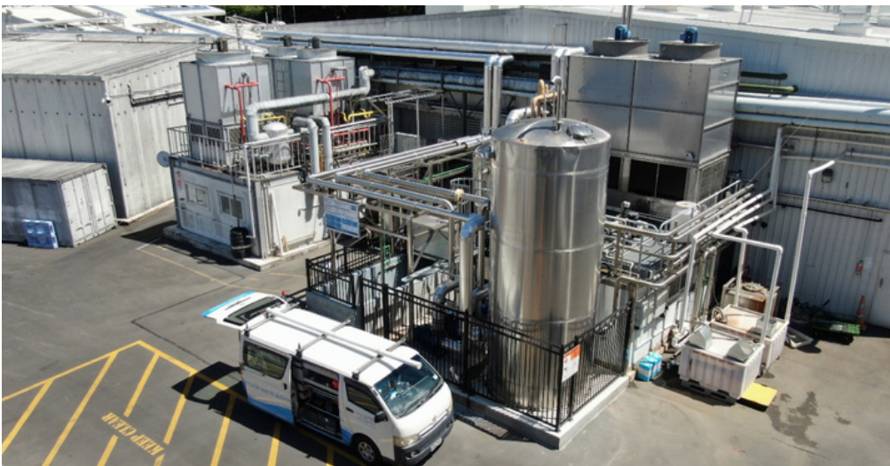
Port Hills Road (PA8) - Energy hub/dryer infrastructure