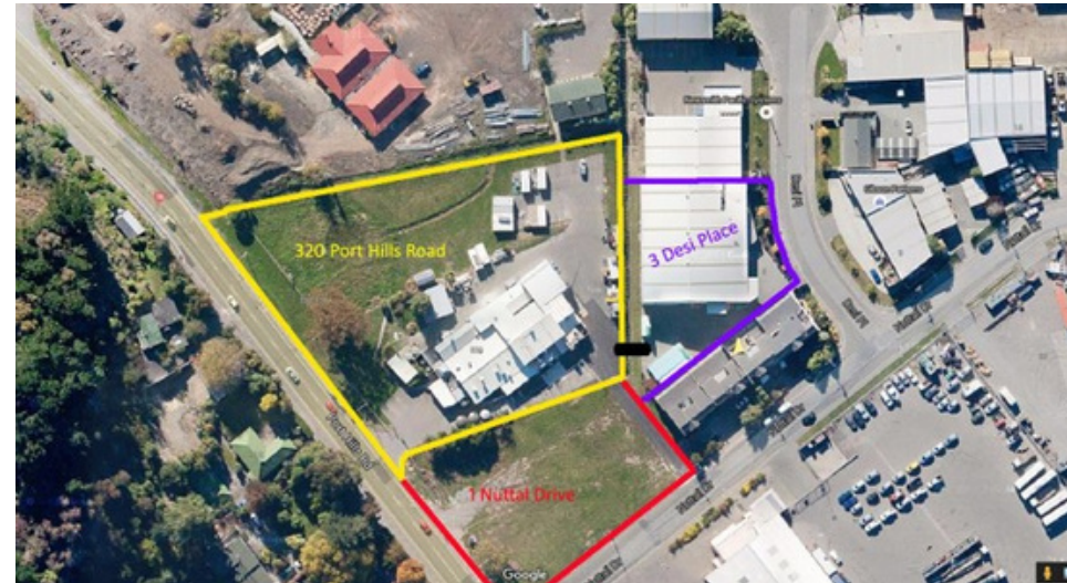
Port Hills Road - Aerial