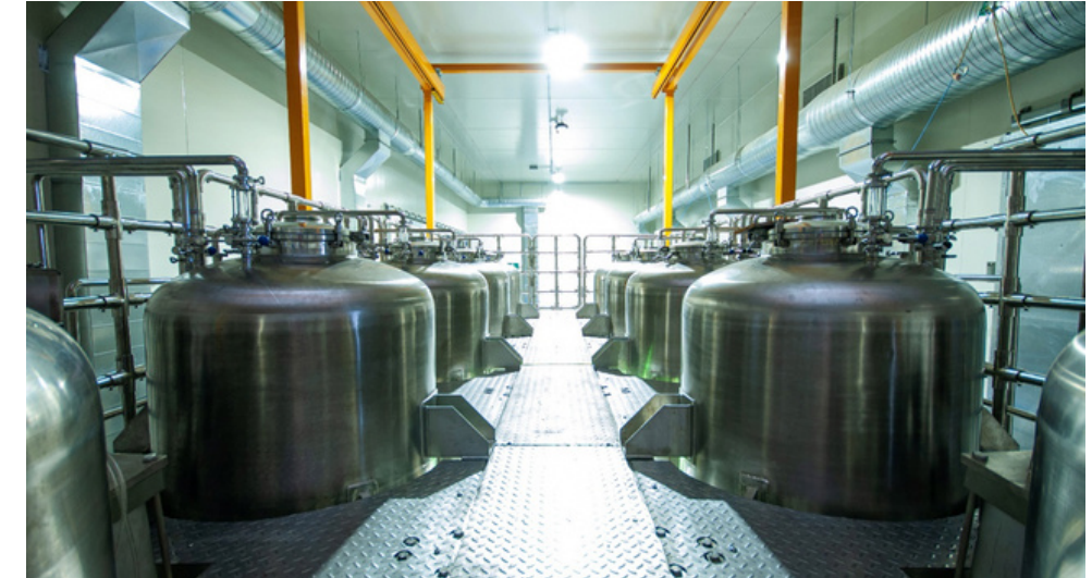
Tawhiri 1 - Extraction plant