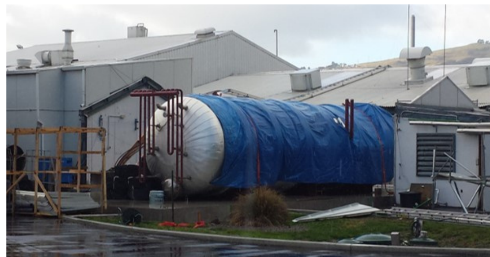
Port Hills Road - First 1,000kg dryer ex China