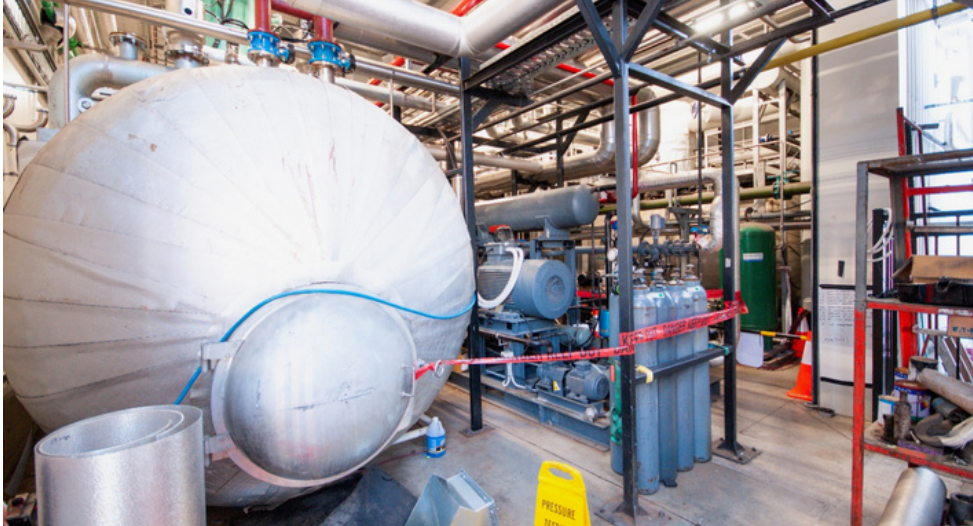
Port Hills Road (PA8) - Second dryer (back of house)