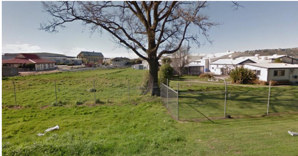
Port Hills Road