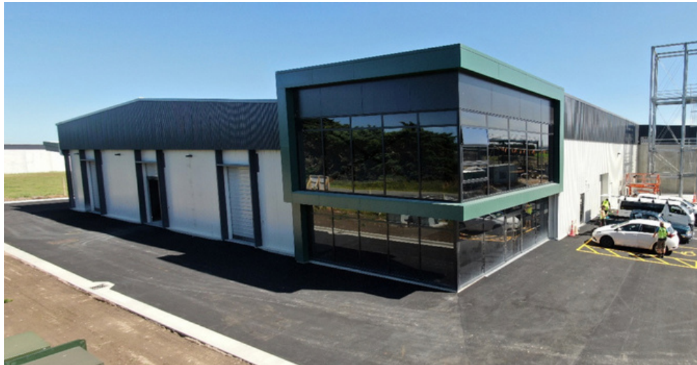
Tawhiri 1 - November 2022